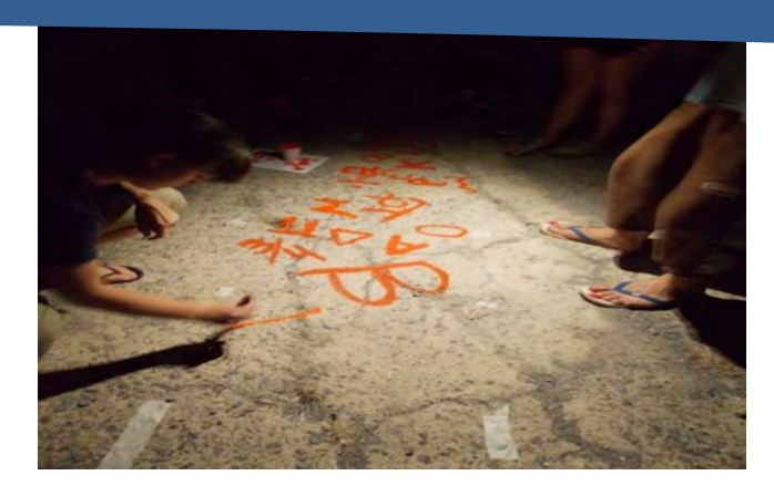
Engaging local communities in heritage asset management through Archaeological Ethnography