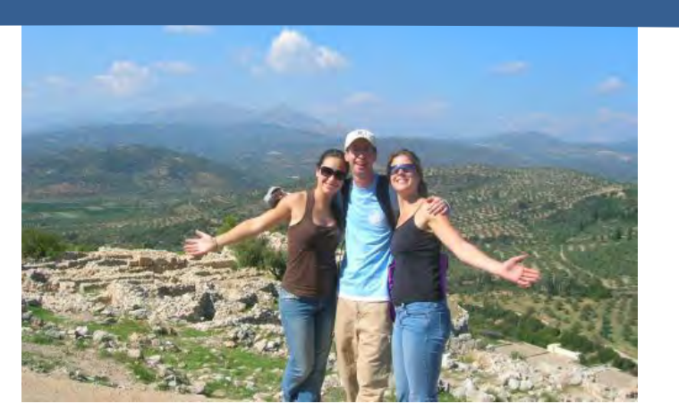
An Introduction to Heritage Management

The digitization field school introduces students to a broad range of 3D recording and mapping techniques and mainly 3D laser scanning and Photogrammetry. Students are provided with hands-on instruction in these methods on site in the historical structures of Nafplion. Students record the towns extensive architectural remains using terrestrial laser scanning, GIS and GPS. The skills learned should allow students to work in digitization of any other site thereafter. An introduction to GIS and Drone technology are also given in this summer program.